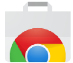
Chrome Web Store